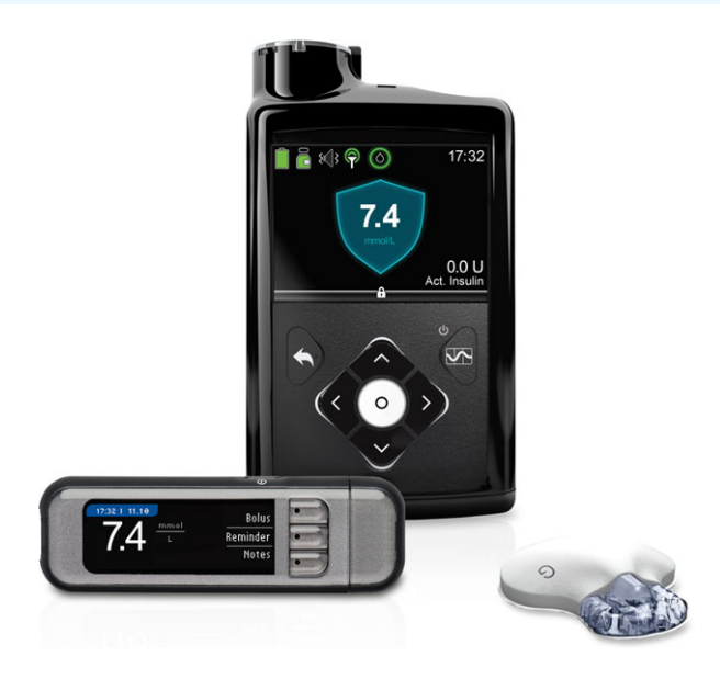
FIGURE 3 Hybrid closed-loop system comprising fourth generation Enlite 3 glucose sensor, MiniMed<sup>®</sup> 670G insulin pump, with an embedded proportional-integral-derivative algorithm with insulin feedback (Medtronic, Northridge, CA, USA. Reproduced with permission from Medtronic.

in the European Union (G5^{TM} Mobile CGM) reflects improved accuracy and reliability of CGM, and is important for improved performance and acceptability of closed-loop systems. Factory calibration of CGM systems excludes an important source of user-introduced error and improves usability. CGM systems that require no calibration are now available (Dexcom G6). The Eversense CGM system (Eversense<sup>TM</sup>; Senseonics Inc., Germantown, MD, USA) is a commercially available long-term fully implantable sensor and allows easy removal of the transmitter without the need for sensor replacement. However, the requirement for implantation and removal with minor surgery causes some discomfort for the patient and requires additional training for clinicians.